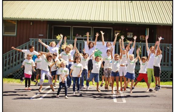
2011 Spy Academy Camp